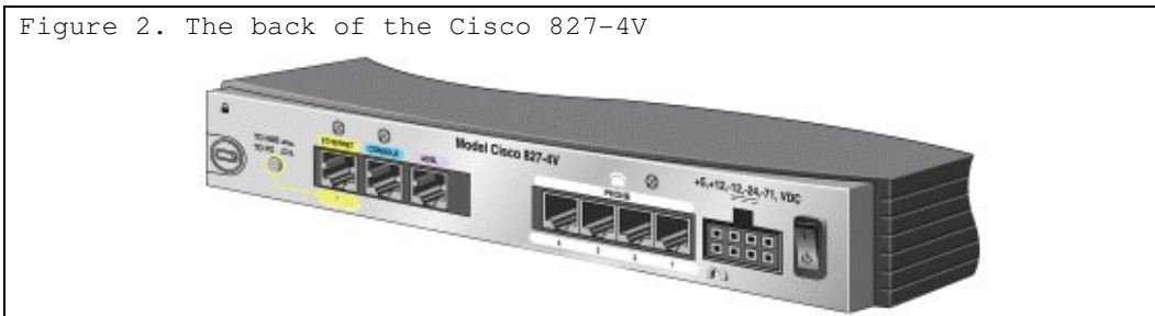
Figure 2. The back of the Cisco 827-4V

Connect the ADSL port from the Cisco 827 to your DSL line using the lavender coloured cable provided by Cisco.