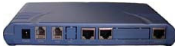
Figure 2. The back of the Addpac AP2007-4V

Using the supplied console cable, connect the to the 'console' port on the AP200. Connect the other end to the serial port of a PC.